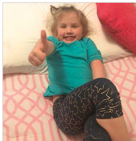
Sleep in Heavenly Peace bed.

Village of Merrillan – First Responders: to replace their 1998 ambulance