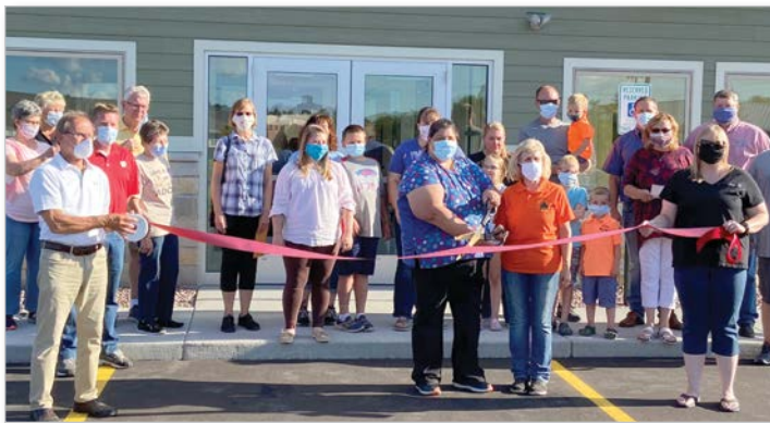
A ribbon cutting ceremony was held at the new animal shelter in August of 2020.