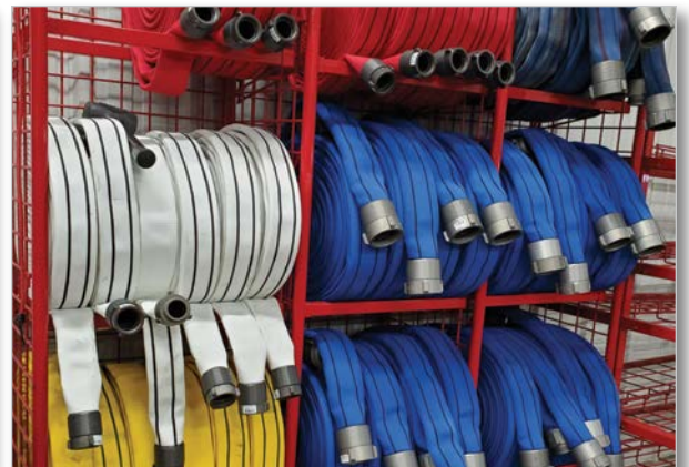
Hixton Volunteer Fire Department received a Foundation Grant in 2020 to replace their hoses and smooth bore nozzles.