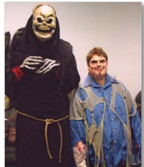
Disability Association of Jackson County provides social events, such as halloween parties, for local people with cognitive and other disabilities.

Thank you DAJC for allowing the Foundation to assist you and to work with your compassionate organization. As with all Foundation contributions, your donation can be directed to any of our funds, now including the Disability Association of Jackson County. If you would like to make a donation or have any questions, please feel free to contact the Foundation office.