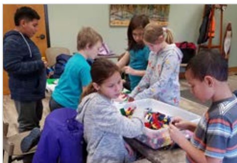
2018 Grant Recipient - City of BRF Public Childrens Library - Lego II Club