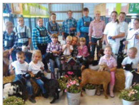
2019 Grant Recipient - Small Animal Pens for the 4H at the Jackson County Fairgrounds