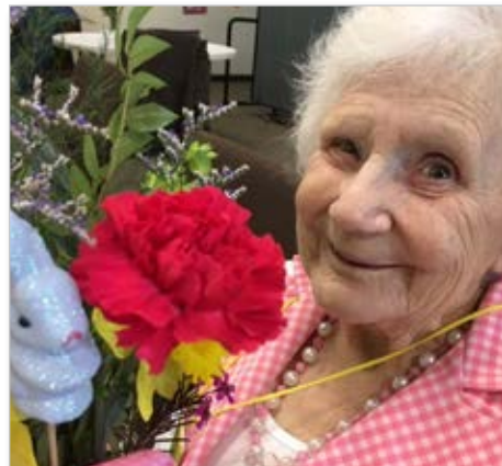
2018 Grant Recipient - Interfaith Volunteer Caregivers