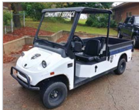
2018 Grant Recipient - City of BRF Police Department - Community Service Vehicle for patrolling Foundation Trail