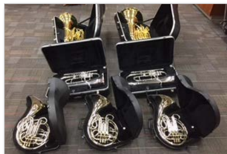
2018 Grant Recipient - ACHM SD - New Musical Instruments

It takes many people to make our Foundation successful, our committed Board of Trustees, our caring and generous donors, and all of the dedicated volunteers working with charitable organizations in our area. None of what we accomplish could be done without each and every one of you. Thank you so much for your continued support!